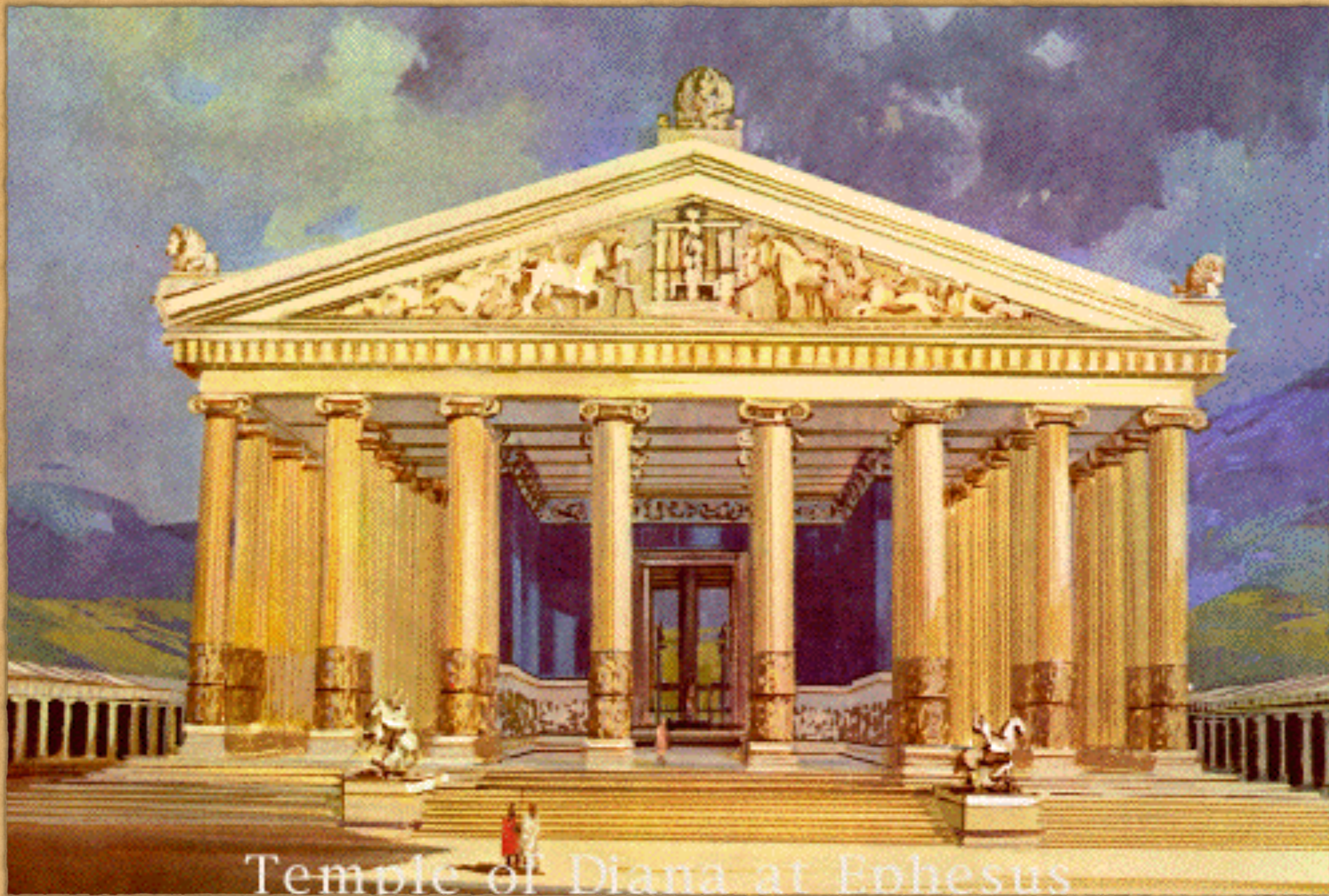
Temple of Diana at Ephesus